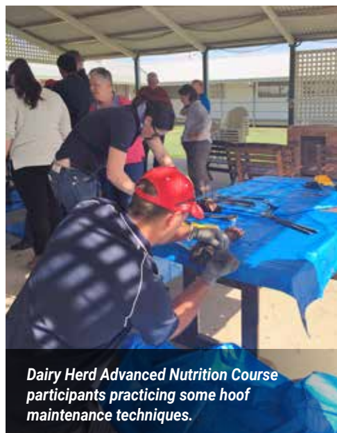
Dairy Herd Advanced Nutrition Course participants practicing some hoof maintenance techniques.

The course has five over-arching themes;