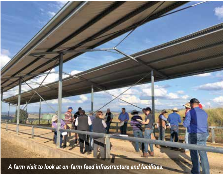
A farm visit to look at on-farm feed infrastructure and facilities.