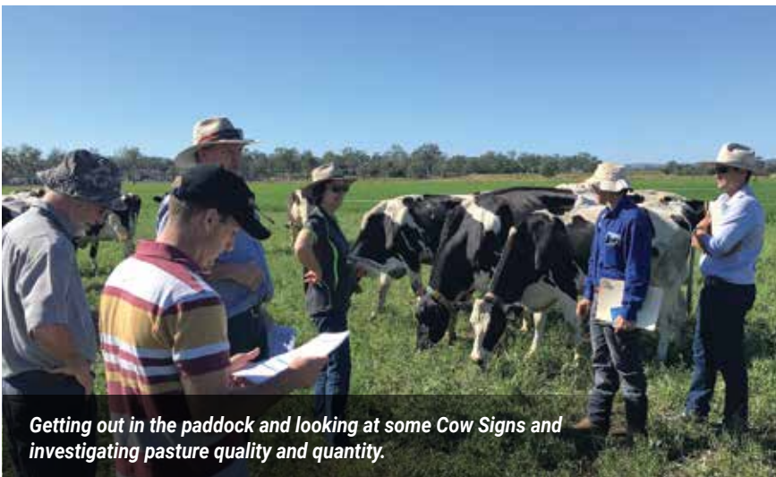
Getting out in the paddock and looking at some Cow Signs and investigating pasture quality and quantity.

A group of 15 farmers and service providers from throughout the Subtropical Dairy region are mid-way through completing the Dairy Australia Dairy Herd Advanced Nutrition Course. This course is one of two pilots being delivered nationally, with the second being held in the Murray Dairy region in Victoria.